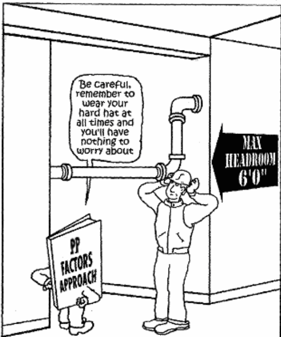
Personal Protective Factors

Sub-systems that include a broad range of working conditions and situations that affect workers.