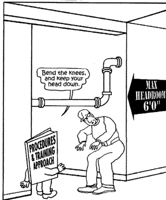
Procedures and Training

The instructions and knowledge necessary to maintain and operate equipment or processes